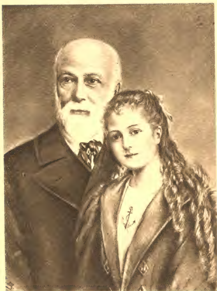
Portrait of Mr. & Mrs. [illegible]