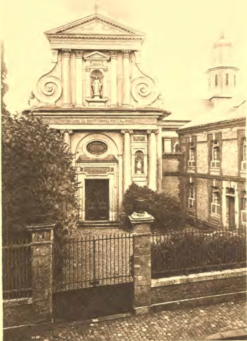
Entrance to the Church