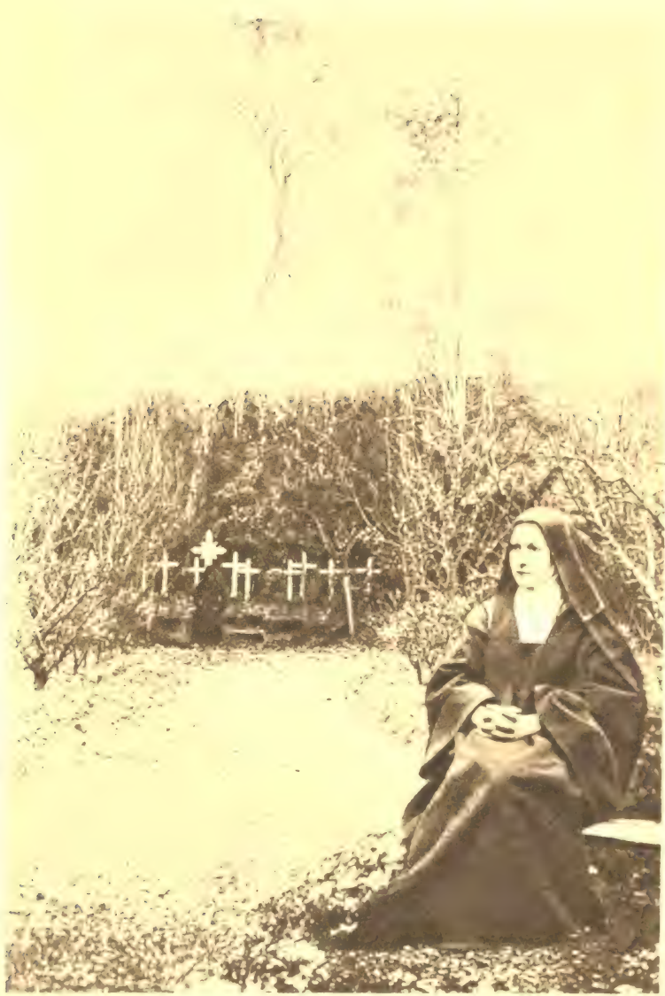
Portrait of a woman in a cemetery