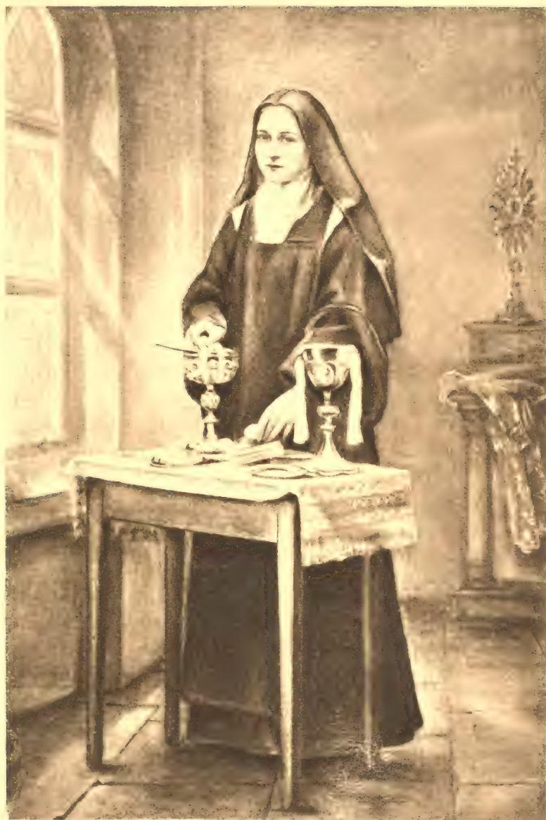
Marie - Antoinette - 1793