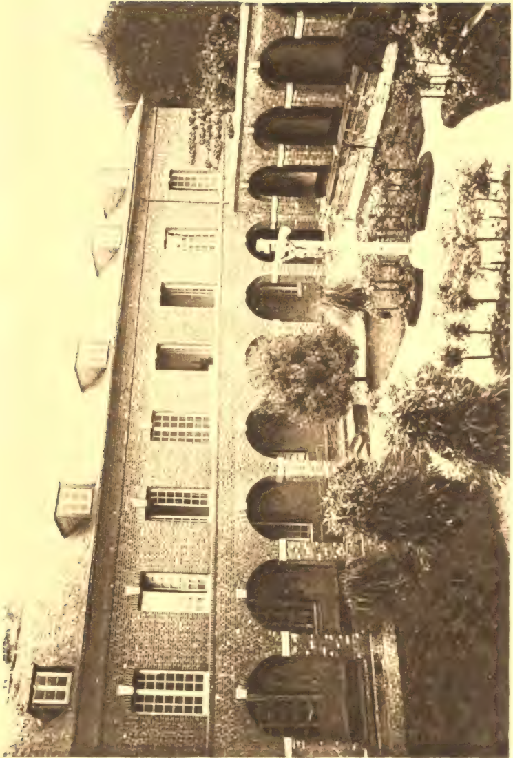
View of the building from the hillside