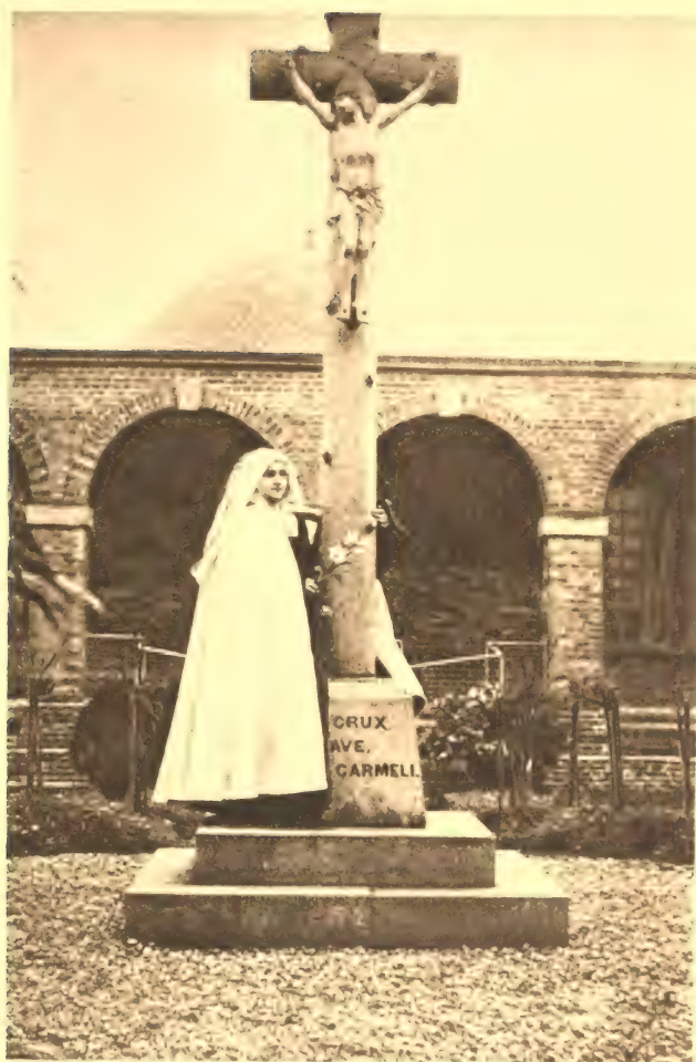
Crux Ave. Carmeli